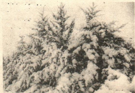
Thick, wet snow clings to evergreens beside the Lake Road.