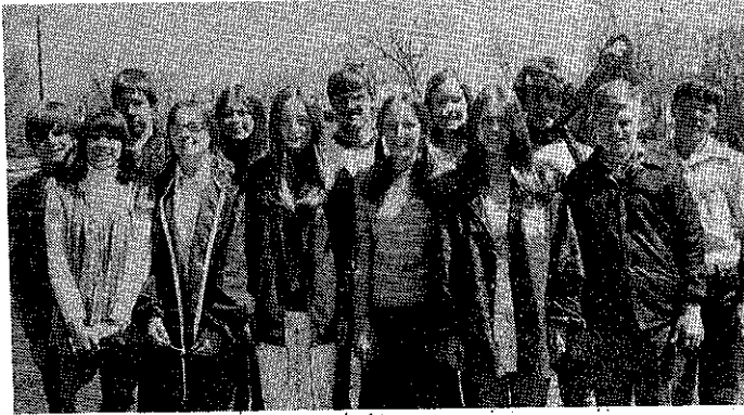
Pictured: play cast for Down to Earth.