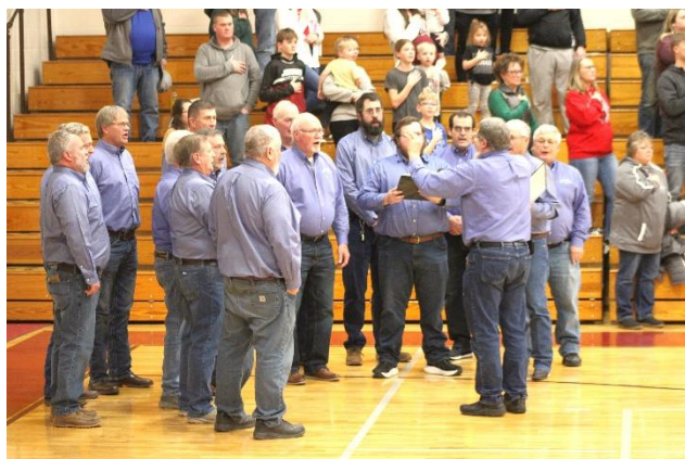
↑ The Dakota Jubilee Men's group singing the National Anthem at a recent BB game.