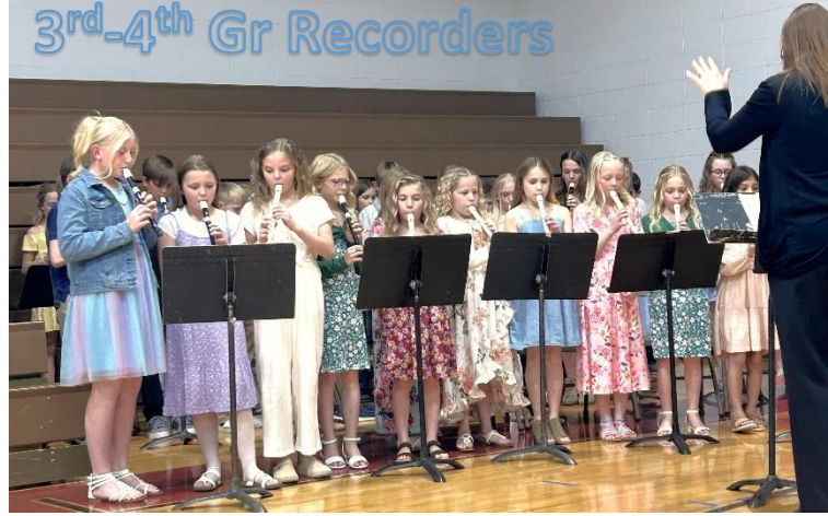
3rd-4th Gr Recorders