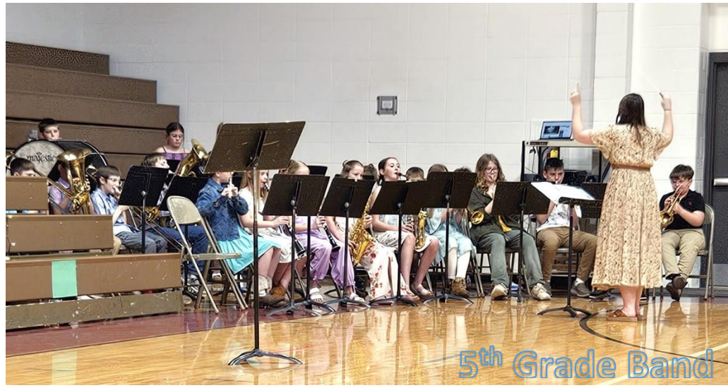
5th Grade Band