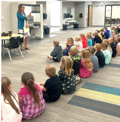
Above: Getting the rules on the first day of school from the principal!