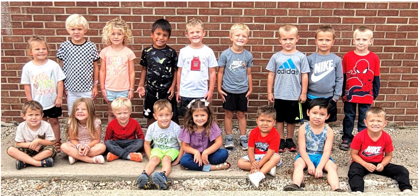
Above: Preschool Corsica Campus