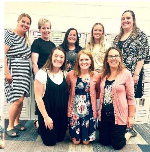
Above: Elementary teachers ready for a new year as well! 😊