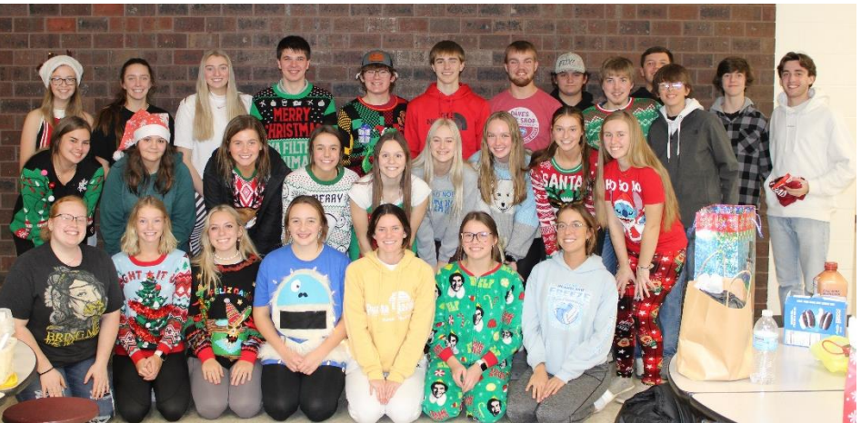
Corsica-Stickney FCCLA and NHS met on December 6th. The students collected food items to be given to the local food pantries of Douglas and Aurora counties. Also, the students competed in several games, shared their favorite holiday snacks and had a small gift exchange.